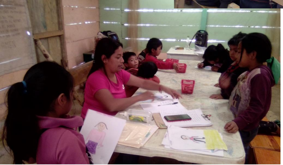
be ready for Sunday's service, and we sent them home with blessings.

biographies. The purpose of these files is to be able to track the work of each child so that we can show visitors what individual kids have accomplished. At the end, they enjoyed sweet bread, gelatin, and juice, and afterwards we carried out our usual cleaning and disinfection of the church so it would