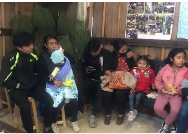
4<sup>th</sup> February Mass at San Benito on the Fifth Sunday after Epiphany