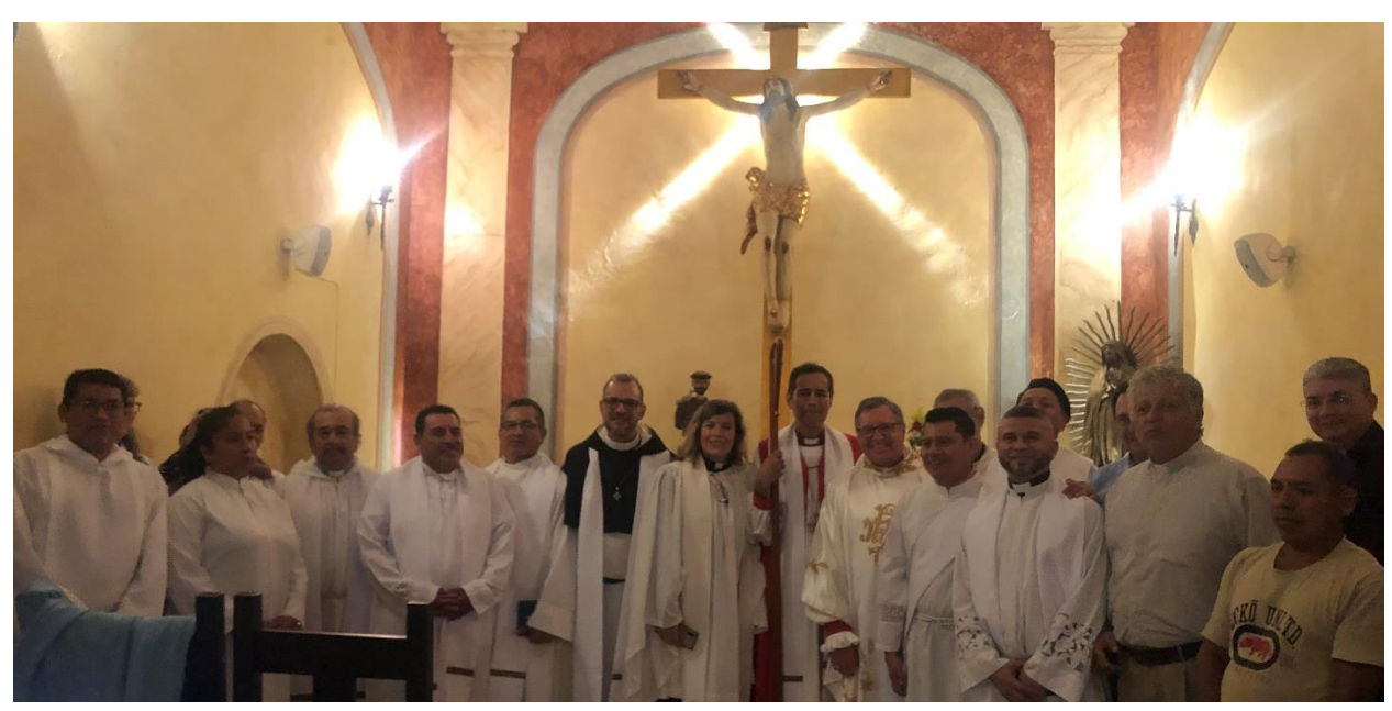
Clergy of the Diocese of Southeast Mexico at the Synod meeting February 2-3, 2024

Bringing the Gospel by Bread & Tortilla Chiapas Project Bulletin # 70, February 2024